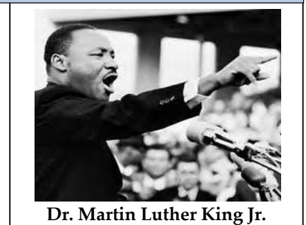
Dr. Martin Luther King Jr.

This in-school residency explores the African-American Civil Rights Movement, the speeches of Dr. Martin Luther King, and Protest and Peace Songs. Students use their knowledge and understanding of American history to explore how artists reflected on the human condition during this important period in our not-too-distant past. Poetry of Americans of diverse backgrounds is also explored as students write about the Civil Rights Movement within their respective communities. These songs and stories become the basis for a dramatic presentation.