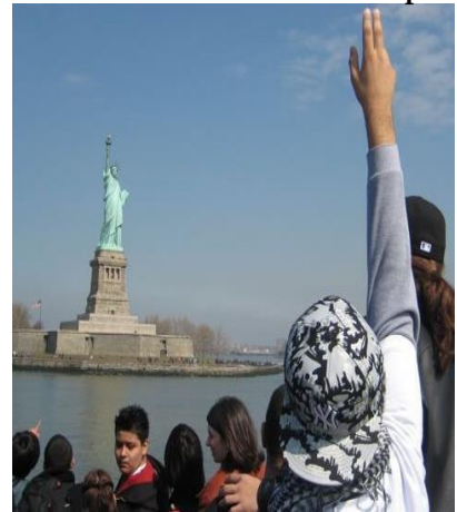
Students at Ellis Island Trip

With the collaborative support of the classroom teacher and teaching artist, the students formulate their research into dramatic writings and songs which are performed for the school and the extended community. Theatre techniques include improvisation, character intent and motivation, script writing, observation, gesture, story dramatization, storytelling, and role playing. Students' original work is published in a collection they can keep. This program has improved class attendance, broadened vocabulary for ESL students and given a positive expressive outlet for all participating students.